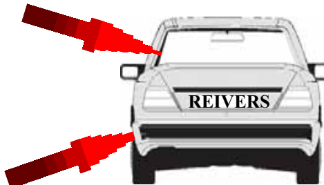
Rear view of vehicle Rear view of vehicle